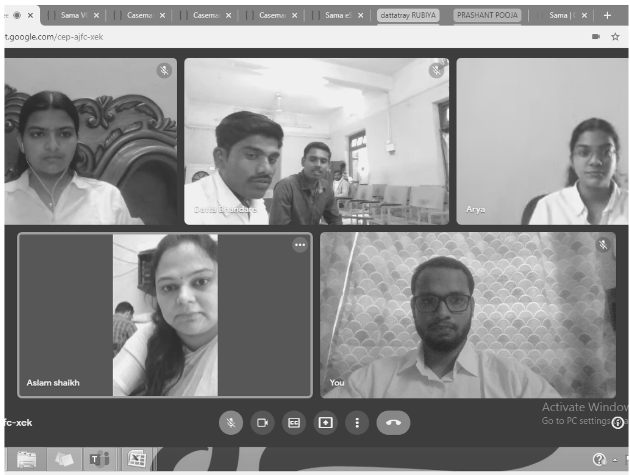
A screenshot from one of our pre-litigation sessions.

This Online Lok Adalat was made possible by Sama, an Online Dispute Resolution platform recognized by the Ministry of Law & Justice.