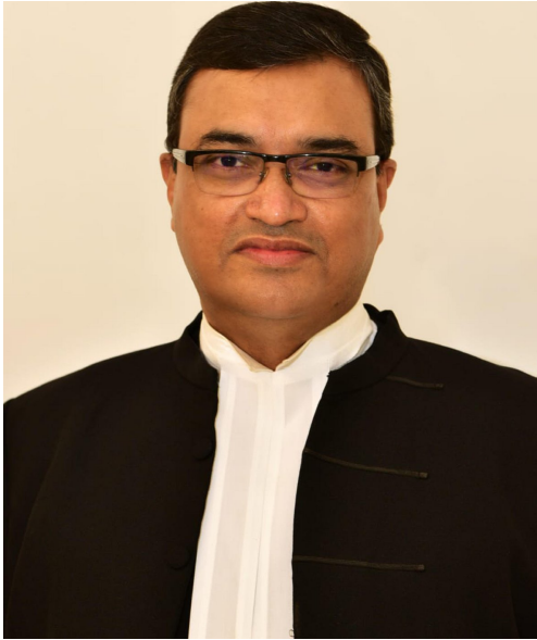
Hon'ble Shri Justice Dipankar Datta The Hon'ble the Chief Justice, Bombay High Court and Patron-in-Chief, MSLSA, Mumbai